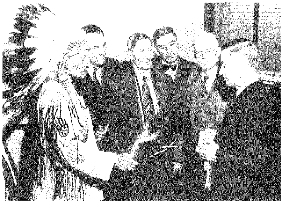
Delegates from the Rosebud reservation discuss land matters on a visit to the Chicago Indian Office in 1943, the year in which the Rosebud Sioux Tribe began an innovative land consolidation program.

In order to control future heirship problems, the TLE provided that land assignees could designate only one beneficiary for each one-hundred-sixty-acre tract. If an assignee died with more than one