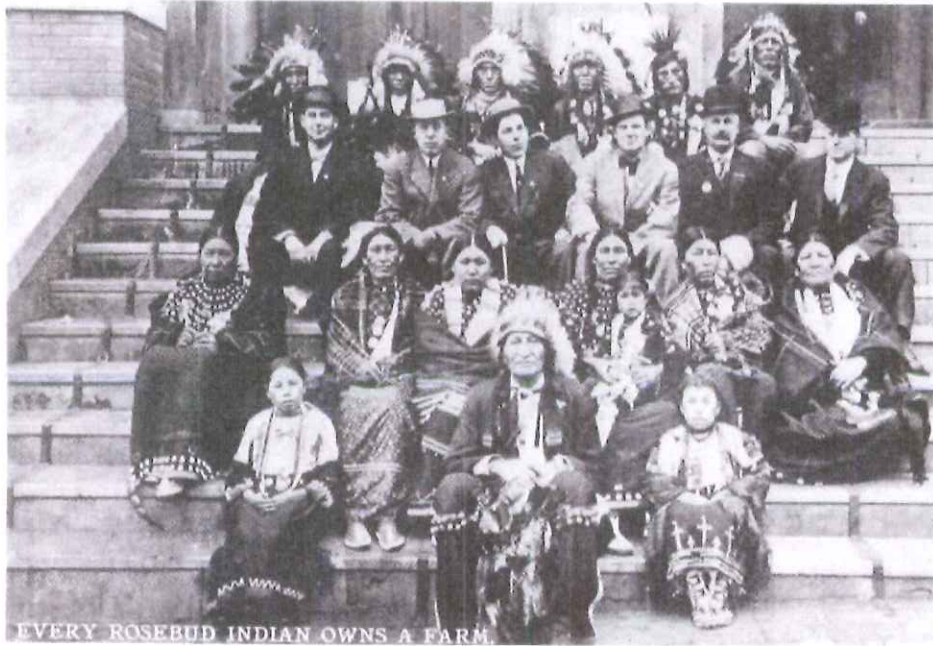
This Bureau of Indian Affairs photograph of Sioux Indians from the Rosebud reservation and non-Indian officials emphasizes the United States policy of imposing European landownership patterns on the natives of the American west.

in granting separate plots of tribal land to individual Indian families for the purpose of establishing agricultural homesteads. 3